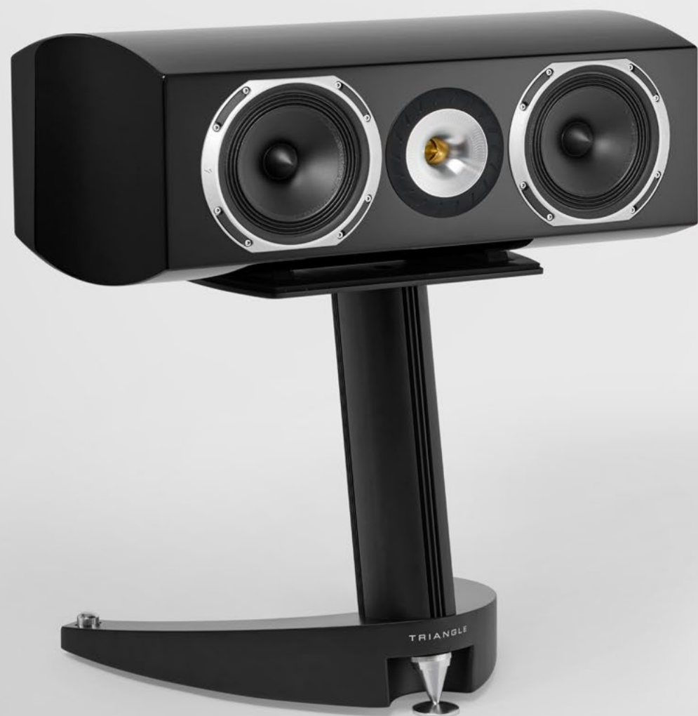
MAGELLAN Voce 40 TH Datasheet